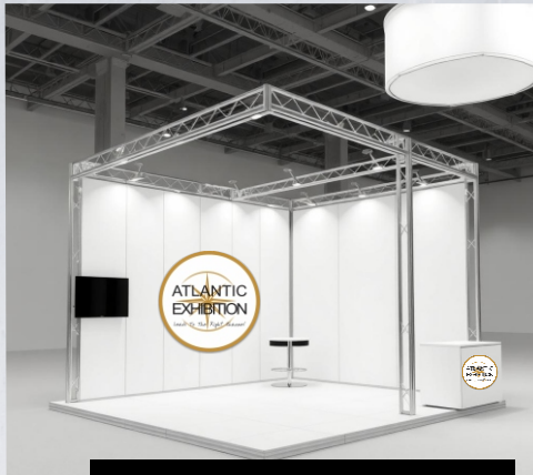
12 sqm Shell Scheme