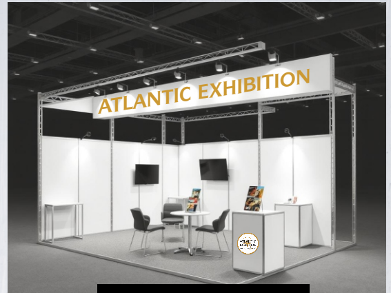
15 sqm Shell Scheme